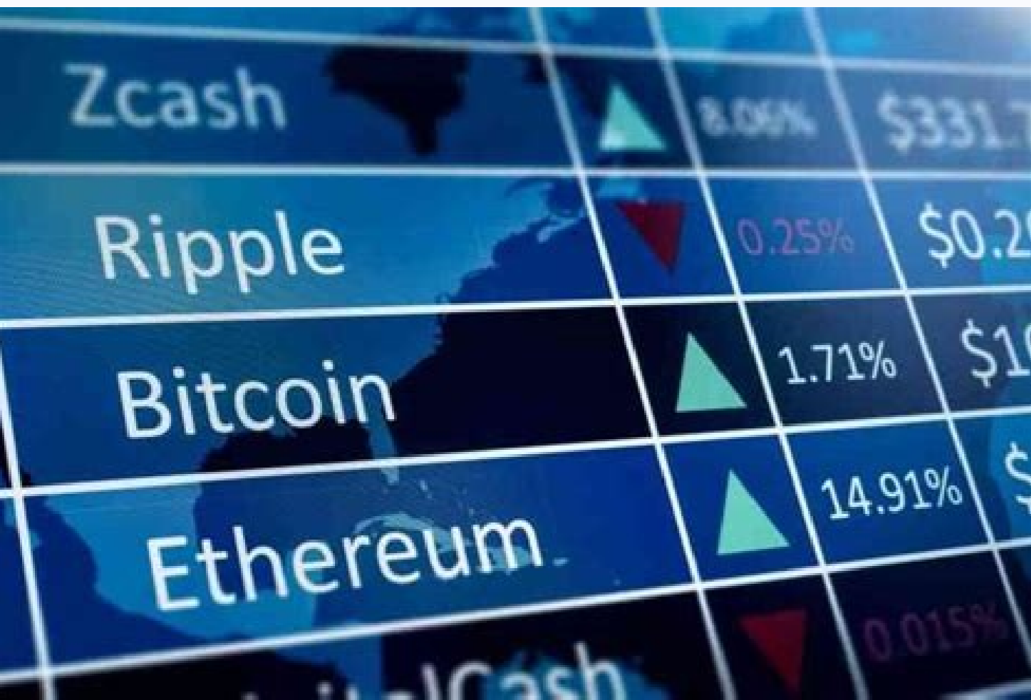
Top 10 crypto exchange platform. Examples of cryptocurrency exchanges. Malaysia cryptocurrency exchange platform. What is the best crypto exchange platform.